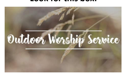
Look for this box:

If you do not have internet access, please leave your RSVP on the church voicemail.